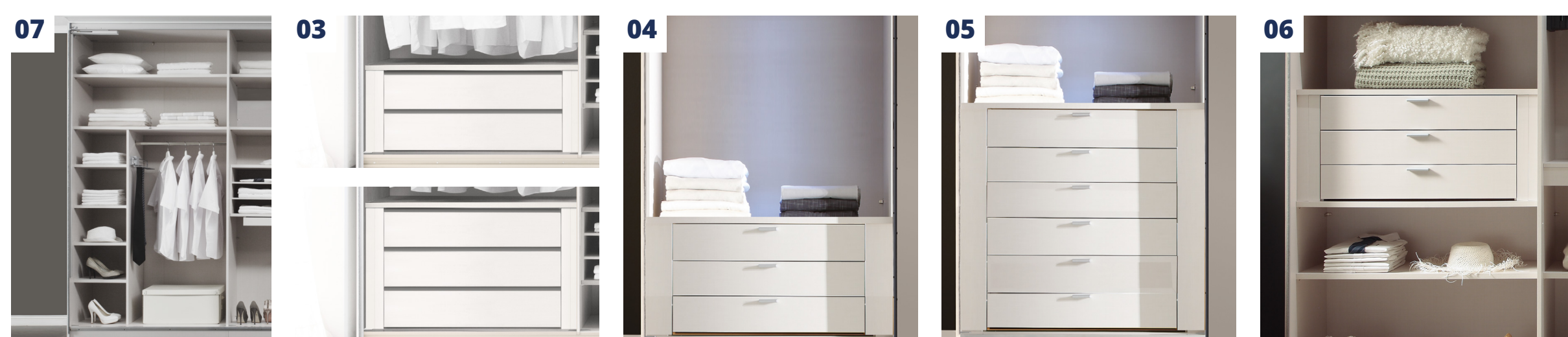
07 T-divider 03 Set of 2 or 3 drawer inserts without handles, with optional soft close function 04 Set of 3 drawer inserts with handles, with optional soft-close function 05 Set of 6 drawer inserts with handles, with optional soft-close function 06 Set of 3 hanging drawers with handles, with optional soft-close function