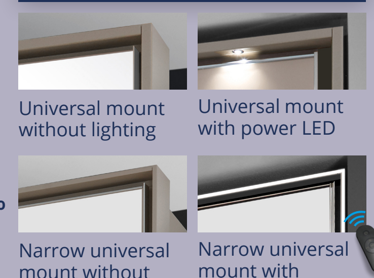
Universal mount without lighting