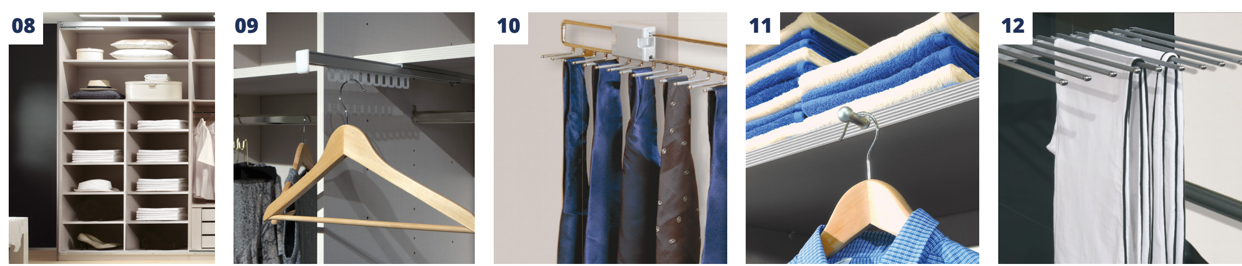
08 T-divider with 8 shelves 09 Extendible dress hanger 10 Tie rack 11 Clothes hook for shelves 12 Extendible trouser rack, narrow 13 Extendible trouser rack, wide