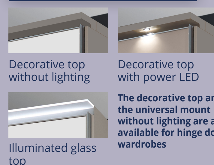
Decorative top without lighting