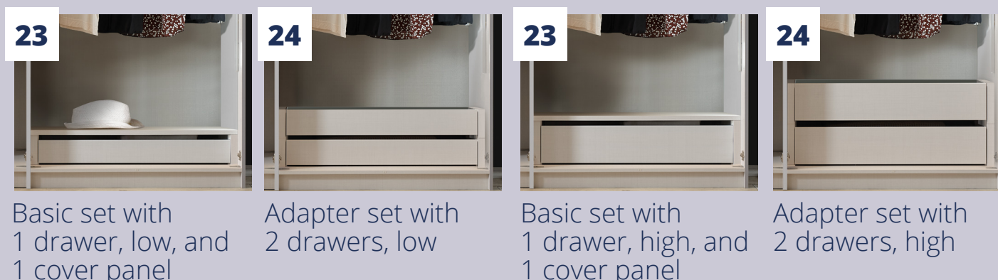
23 Basic set with 1 drawer, low, and 1 cover panel

The drawers for the basic and adapter element can be extended in terms of height. They are delivered with a soft-close function as standard.