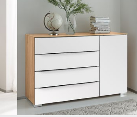
Wide combi chest